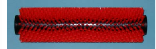
Red brush roller INTERMEDIATE (standard) Rullo rosso INTERMEDIO (standard) MITTLERE rote Rolle (standard) Rouleau rouge INTERMEDIAIRE (standard) Rodillo rojo INTERMEDIO (standard)

Sólo utilizar los pinceles que vienen con el dispositivo o se especifica en el manual de instrucciones. El uso de otros cepillos puede comprometer la seguridad.